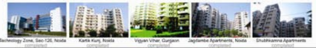
Technology Zone, Sec-126, Noida Kartik Kung, Noida Vigyan Vihar, Gurgaon Jagdamba Apartments, Noida ShubhKarma Apartments