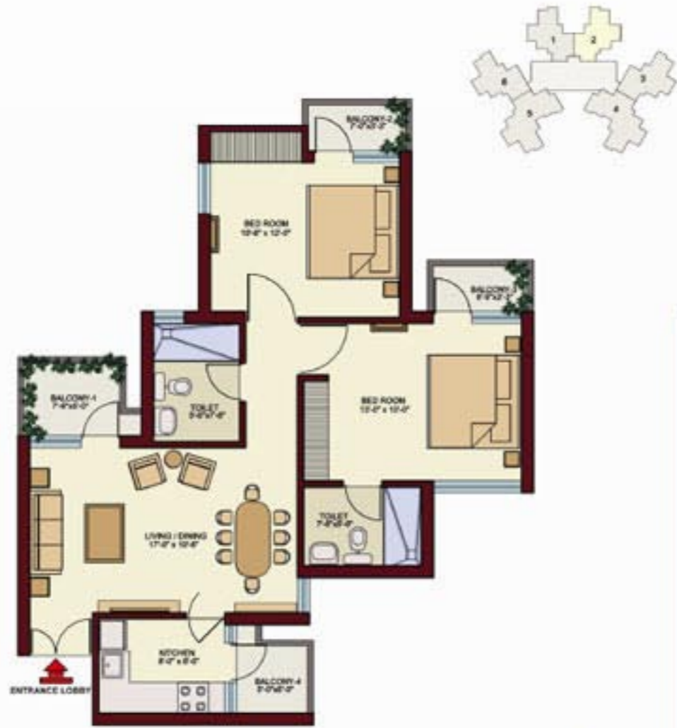
Super Area: 885 sq. ft. : 2 Bedroom Apartment 1 Bedroom + Drawing/Dining + Kitchen + 2 Toilets + 4 Balconies