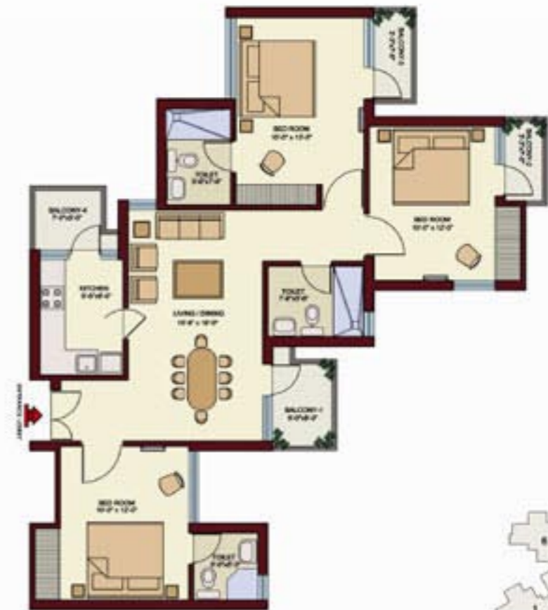
Super Area: 1275 sq. ft. : 3 Bedroom with Guest Room 3 Bedroom with Guest Room + Drawing/Dining Room + Kitchen + 3 Toilets + 4 Balconies